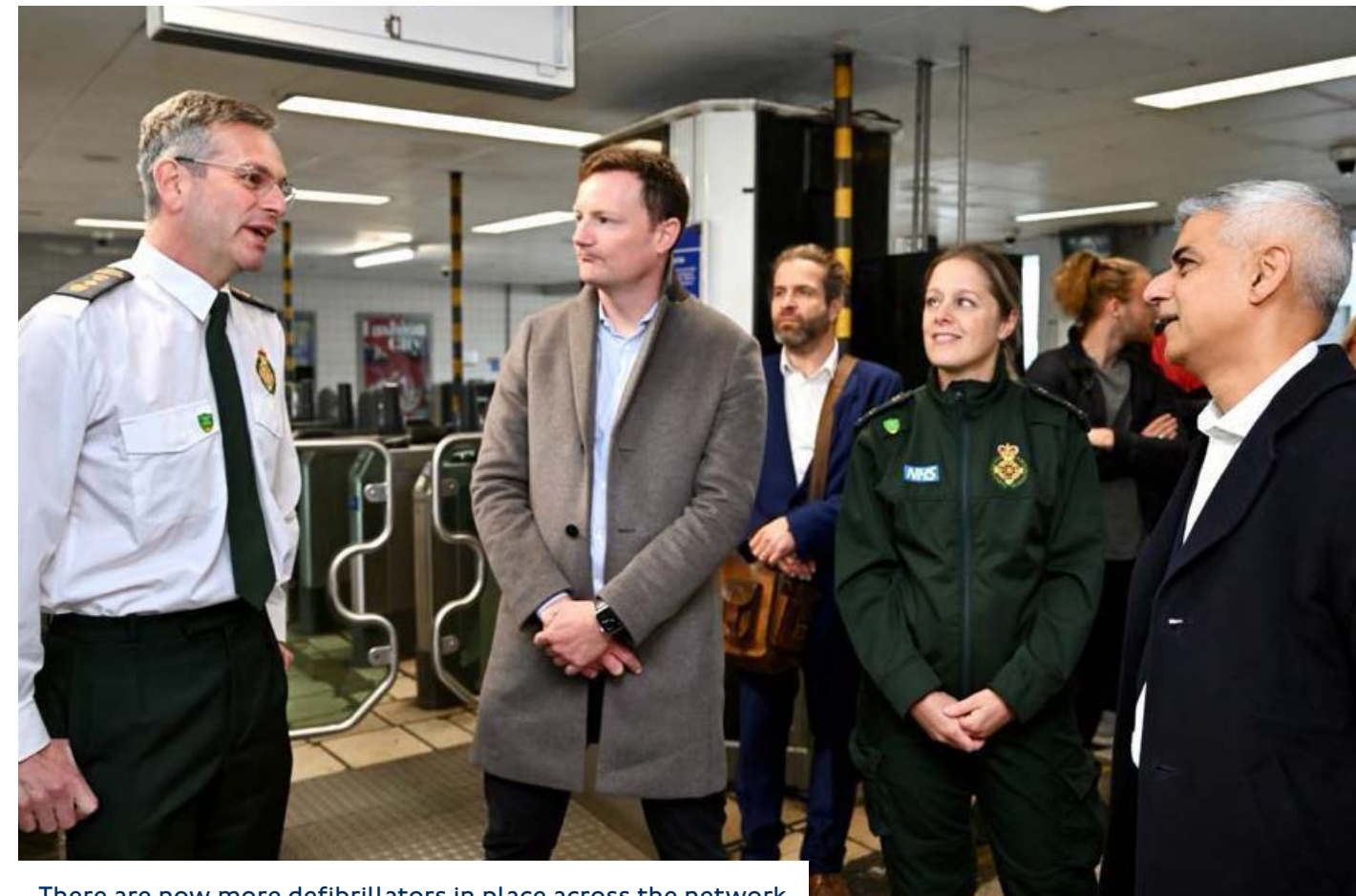
There are now more defibrillators in place across the network

In October 2023, a new 20mph speed limit was introduced on the A205 corridor in Greenwich between Woolwich and Well Hall roundabouts, as well as on the majority of TfL roads in the Royal Borough of Kensington and Chelsea. Introduction