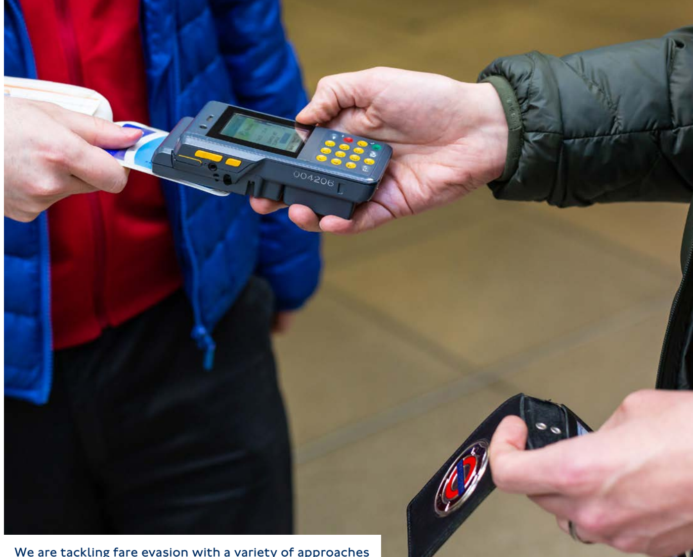
We are tackling fare evasion with a variety of approaches

Our analytical teams are in the process of gaining additional insight on the influence of the cost-of-living crisis on fare evasion and offender behaviours. Fare evasion